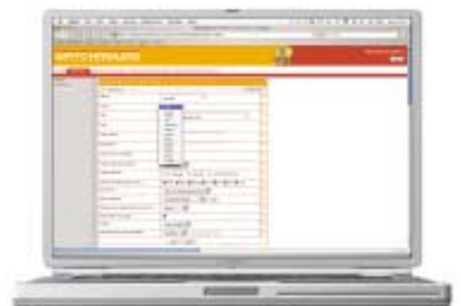
Setting up your monitoring configuration is flexible and easy.

Sign up for a free 30 day trial at www.watchmouse.com/trial