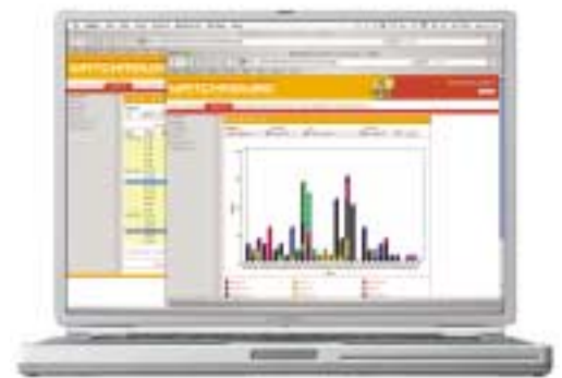
View the performance of your server in different types of graphs.

The reports and graphs produced by WatchMouse will help you to verify your Service Level Agreements (SLAs). Your internet provider or datacenter may guarantee a 100 percent uptime but unless you use the right tools you will never know this for sure. Keep in touch with your site's performance and have it checked for availability and other problems up to 9,000 times per server per month.