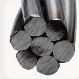
1 x 7 Strand