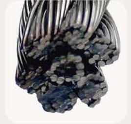
7 x 19 Strand