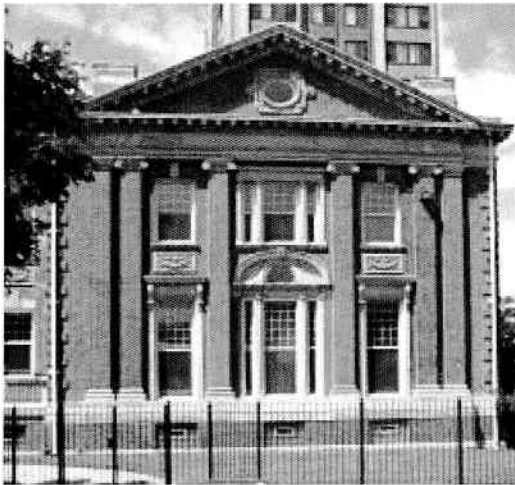
The Chicago Orphan Asylum Building is located on the northeastern edge of the Washington Park community area at 5120 S. King Dr., facing Washington Park itself. Built between 1898-99, the Asylum Building was designed in the Colonial Revival architectural style by Shepley, Rutan & Coolidge.