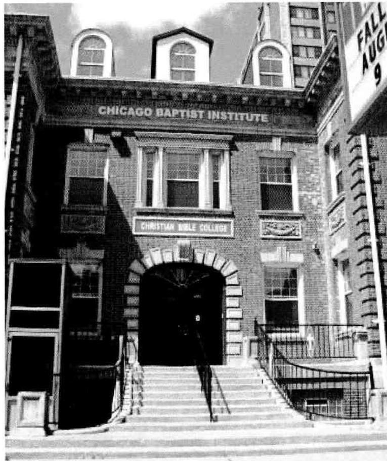
Right: The building's main entrance is centered on the front facade and sheltered within a quoin-decorated archway reached by a short flight of steps.