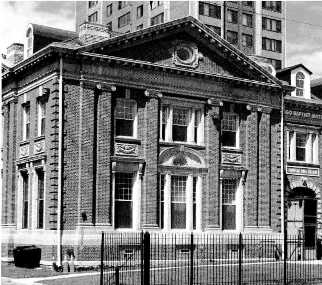
The Chicago Orphan Asylum Building is a visually-distinctive building with its red-brick walls and pale yellow terra-cotta Classical-style ornament.