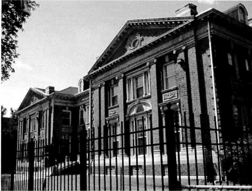
Top: The Chicago Orphan Asylum Building is 2 1/2-stories in height and designed in the Colonial Revival architectural style. Red-brick walls are ornamented with brick Ionic pilasters and terra-cotta cornices, window surrounds, and spandrel panels.