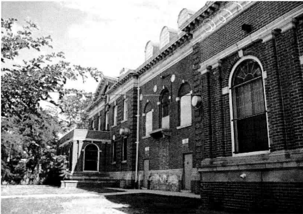
Top: The side elevations are similarly decorated with brick pilasters and Classical-style terra-cotta ornament.