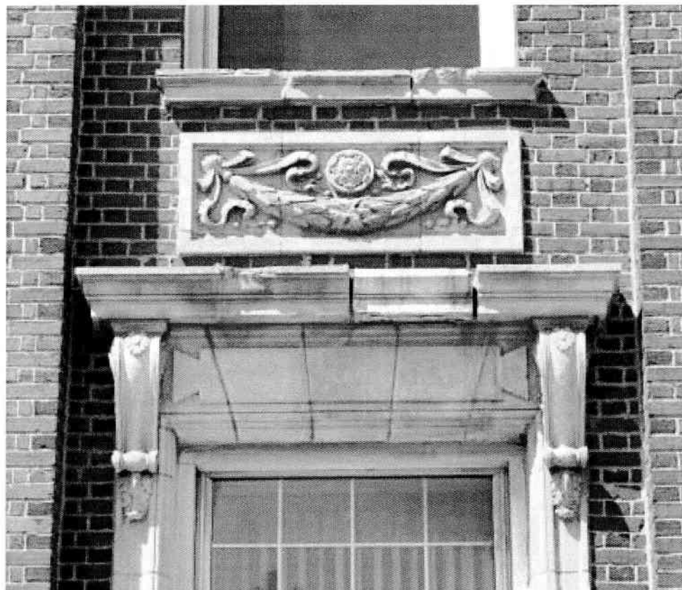
Photos of the Building's Classical-style ornament.