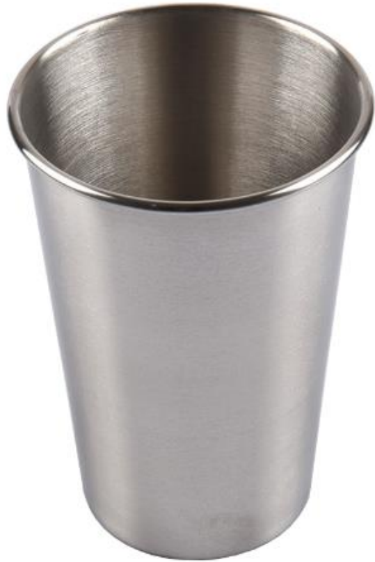
NM230 / NM350M / NM500