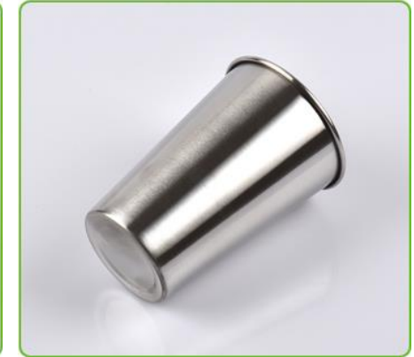
NM230 / NM350M / NM500