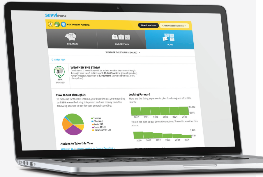
Sample Weather the Storm Goal

Access to a robust educational resource library