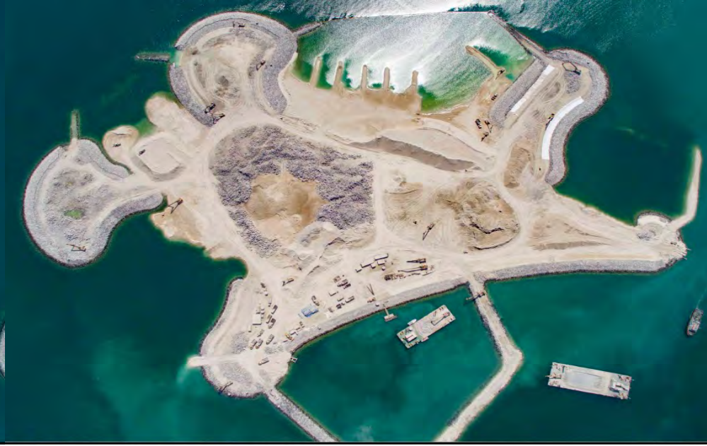
UCC Lusail Island 3C - 27 September 2016