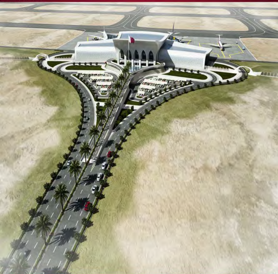
DUKHAN INTERNATIONAL AIRPORT LANDSIDE APPROACH