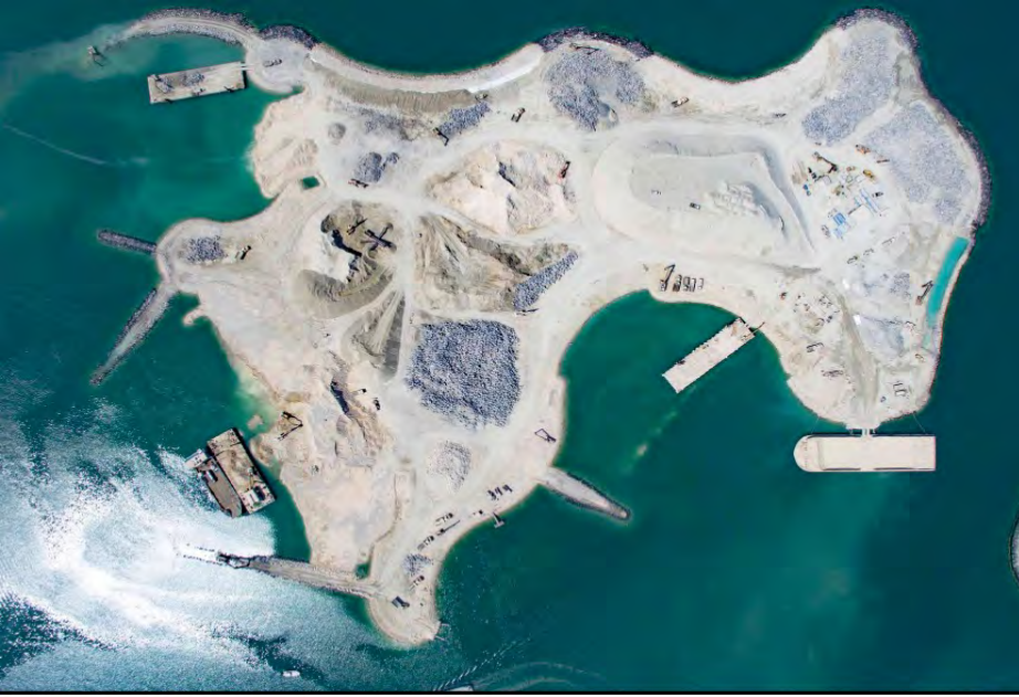
Lusail Island 3B - 27 September 2016