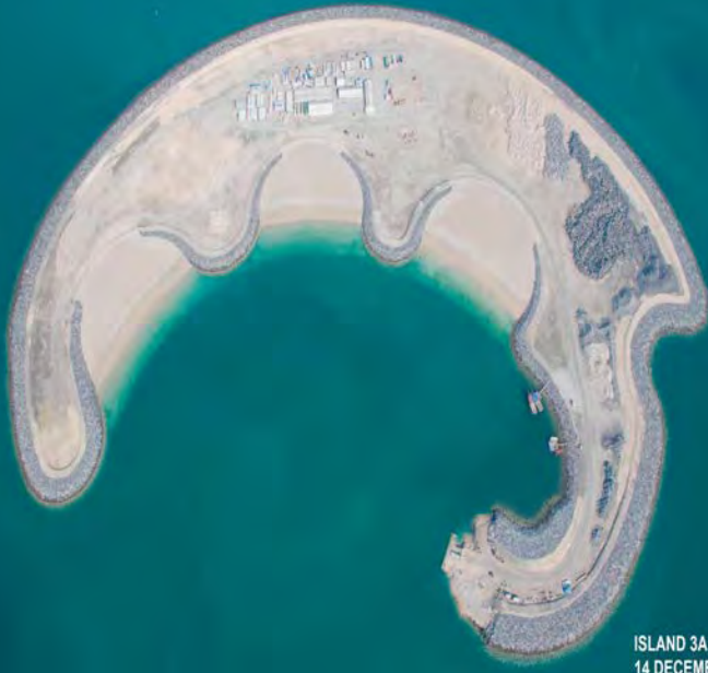
ISLAND 3A 14 DECEMBER 2016