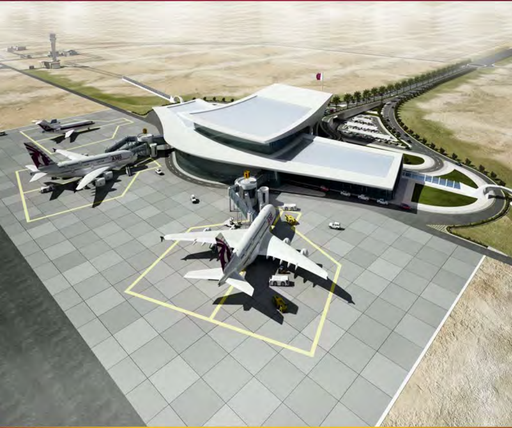
DUKHAN INTERNATIONAL AIRPORT AIRSIDE PERSPECTIVE