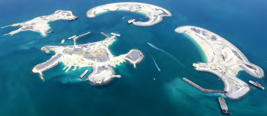
During Construction Stage